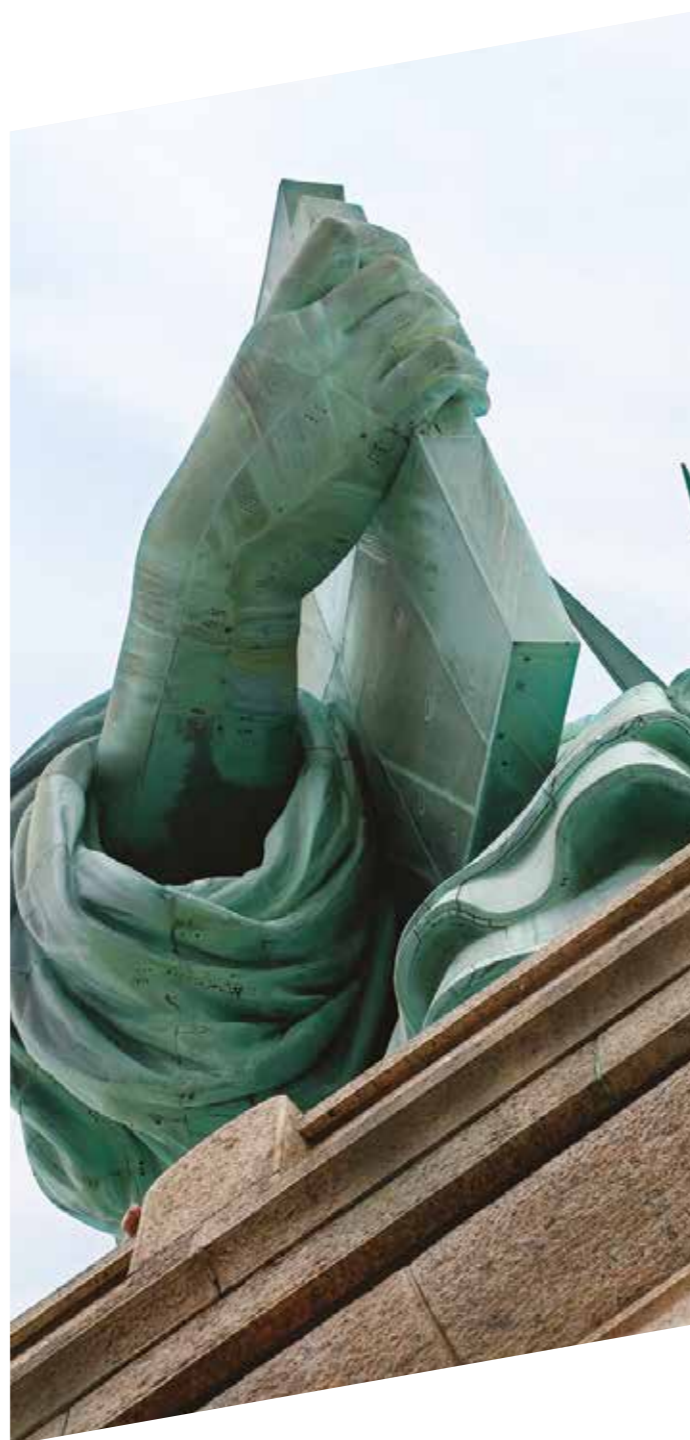
reimbursement, scope of coverage, or other aspects of any travel insurance policy or claim.

If an air reservation is made by Costsaver, full payment may be required for your airfare at the time of booking. On receipt of full air payment your airfare, taxes and fuel surcharges are final. This will be regardless of future price fluctuations up or